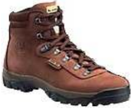
LA SPORTIVA TIBET ♀♂ Gore-Tex®

The upper, cut in one piece, makes it exceptionally solid and waterproof. Suitable for hiking over rugged ground in any season.