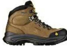
VASQUE WASATCH ♀♂ Gore-Tex®

High-quality boot that lives up to its namesake mountain range. Incredible fit and construction has earned this boot its rock solid reputation