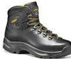
ASOLO TPS 535 V ♀♂

The Triple Power Structure line guarantees you maximum quality in all the materials used. Excellent durability and performance.