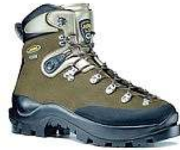
ASOLO GRANITE GV

Upper Perwanger leather mm 2,2-2,4 Lining Gore-Tex Performance Asoflex Ascent Anatomic Footbed Lite 3 Sole Vibram Vertige+ PU attachments for semi-automatic crampons