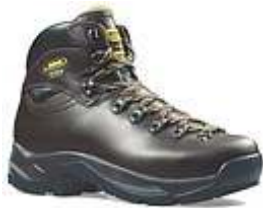
ASOLO TPS 520 GV ♀♂ Gore-Tex®

The Triple Power Structure line guarantees you maximum quality in all the materials used. Excellent durability and performance.