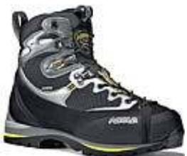
ASOLO EXPERT GV

Shell: PU Inner shoe: 5 layers for waterproof, heat and comfort Inner Boot: Velveteen Asoframe: PU Anatomic Footbed: AFS Sole: Vibram nilgiri dual-color