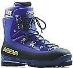
ASOLO AFS EVOLUZIONE

The Alpine Line knows mountain limits. But never accepts them. Alpine line footwear are made to exceed the biggest mountain obstacles, in order to match up to its standard. Crampon-compatible whether they be automatic or semiautomatic, they know how to challenge the impossible.