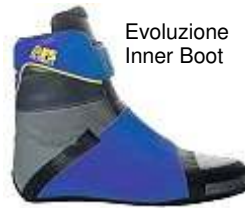
Evoluzione Inner Boot

Shell: PU Inner shoe: 5 layers for waterproof, heat and comfort Inner Boot: Velveteen Asoframe: PU Anatomic Footbed: AFS Sole: Vibram nilgiri dual-color