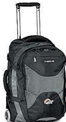
LOWE ALPINE TT Roll-On 40

Sized to maximise hand luggage regulations of most major airlines. Hidden tuckaway harness for alternative carrying. Large front zippered entry for ease of access.