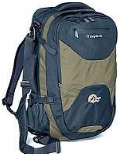
LOWE ALPINE TT Carry-On 40

The Asolo Navigator: the only other thing you need to buy is your ticket! This is the Travel Pack that covers all options: removable daypack; removable waistbag, built-in raincover, coin pocket on waistbelt, a durable harness that folds away.