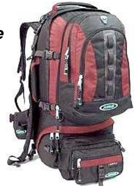
ASOLO Navigator Elle

The Asolo Navigator: the only other thing you need to buy is your ticket! This is the Travel Pack that covers all options: removable daypack; removable waistbag, built-in raincover, coin pocket on waistbelt, a durable harness that folds away.