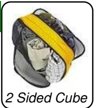
2 Sided Cube