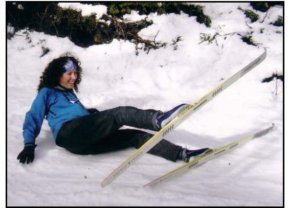
..... And Down!

My friend that I had dragged along on snow shoes was soon eating my powder! We continued up to Lookout Rock , then finished